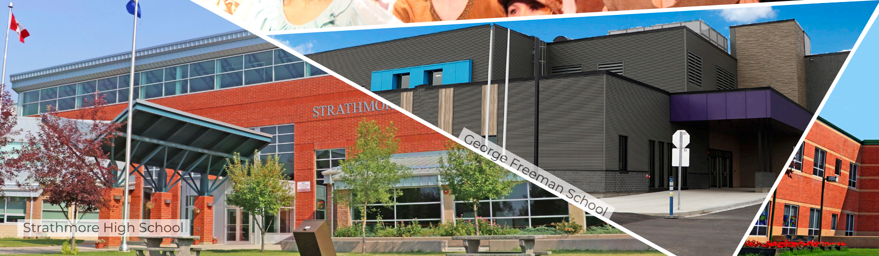
Strathmore High School