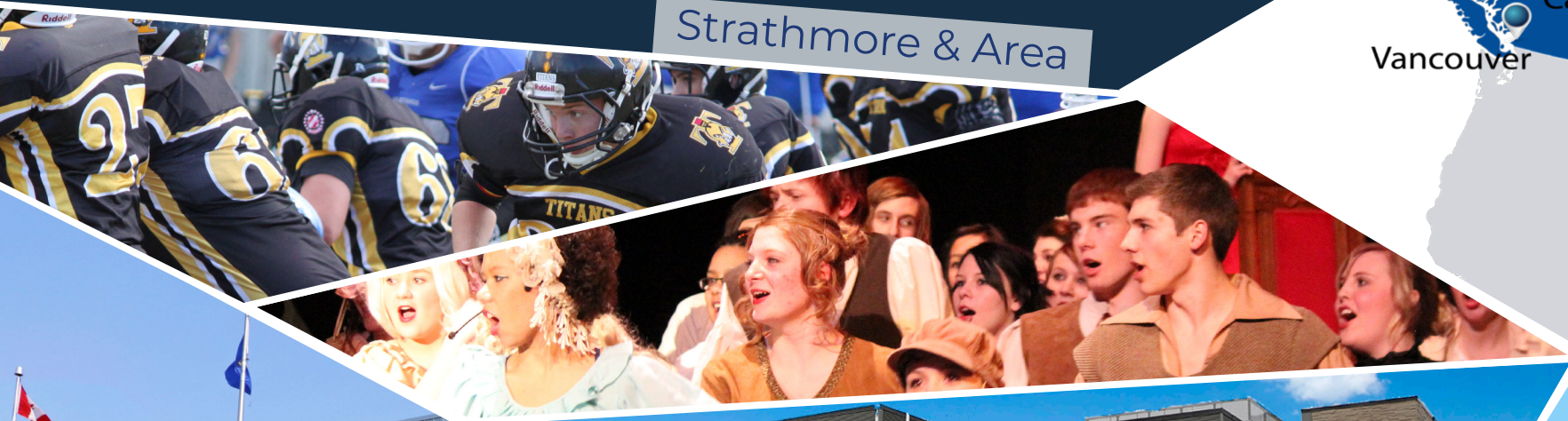
Alberta Calgary Vancouver